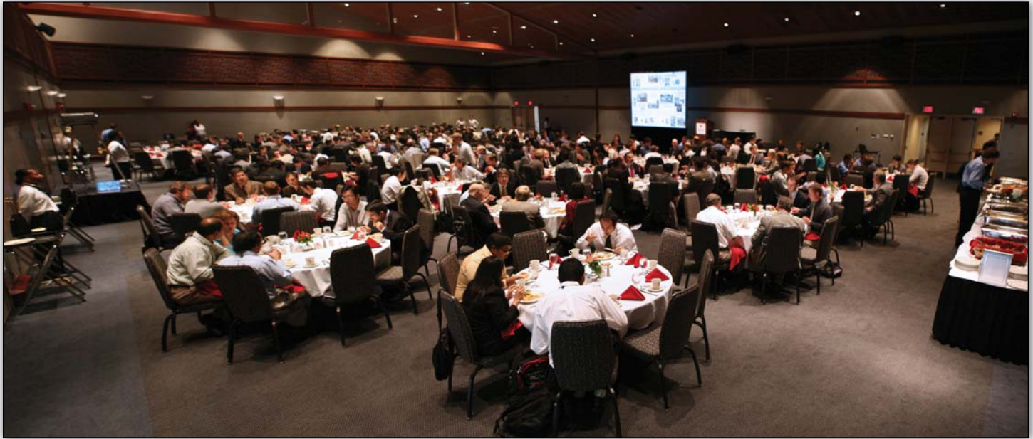
The meeting provided a venue for lots of interaction and discussion among participants.