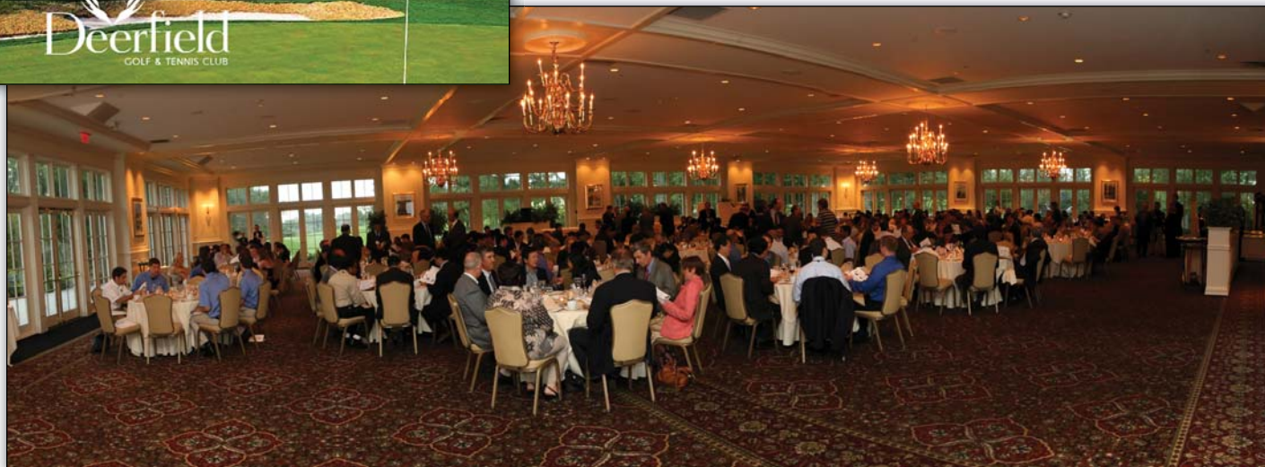
The ASC Awards Banquet was held at The Deerfield Golf & Tennis Club in Newark, DE.