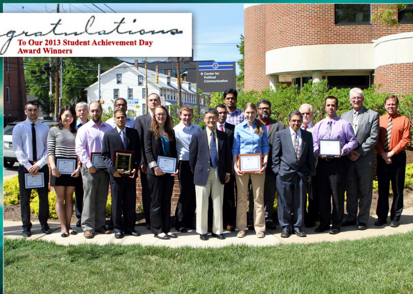
On Friday, May 3, nine students and five CCM professionals were honored at the Center's annual Student Achievement Day.

Congratulations To Our 2013 Student Achievement Day Award Winners