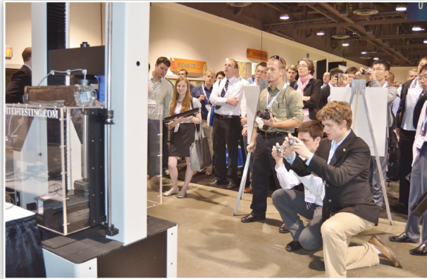
UD students watch as a test is conducted on one of their bridges.